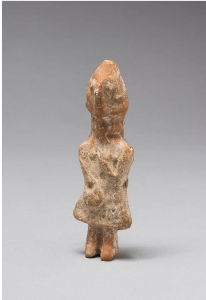
Figure Wearing Tunic