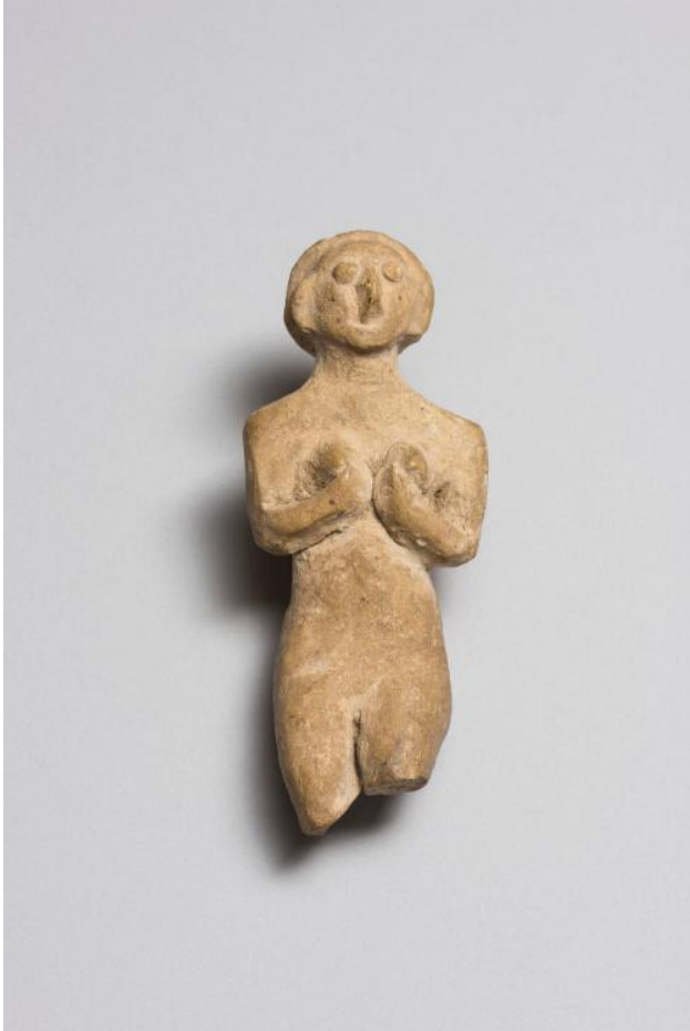
Figure of a Nude Woman